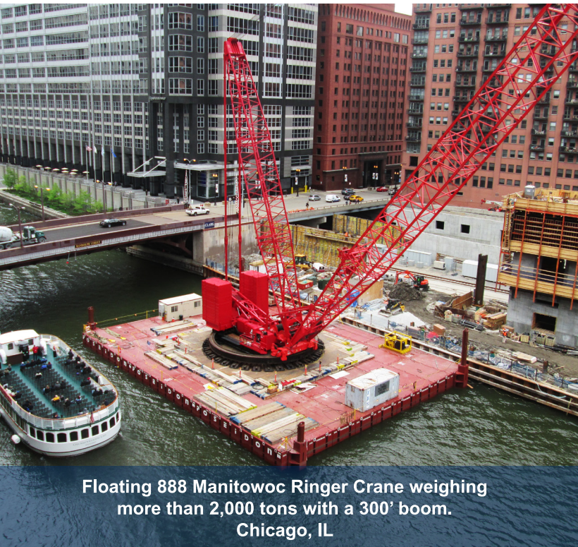
Floating 888 Manitowoc Ringer Crane weighing more than 2,000 tons with a 300' boom. Chicago, IL